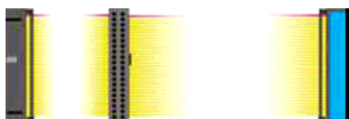
40-pin ATA100 IDE Cable x 1