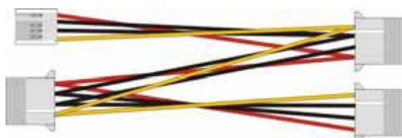
4-pin to 4-pin Power Cable x 1