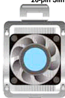
CPU Cooler x 1