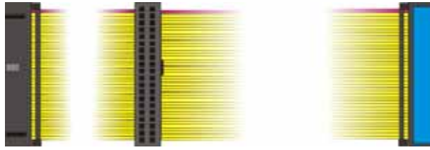
40-pin ATA100 IDE flat cable x 1